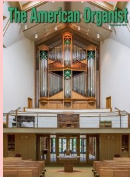
December 2017 Issue

Read the latest issue of The American Organist on line at agohq.org .