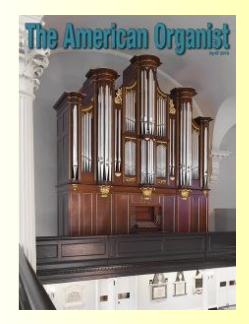
April 2018 issue