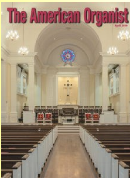
TAO April 2019