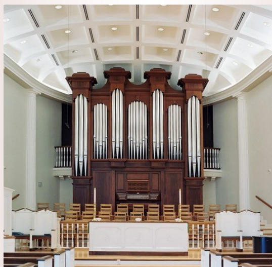
First Presbyterian: C.B. Fisk, 2002 (III/52)