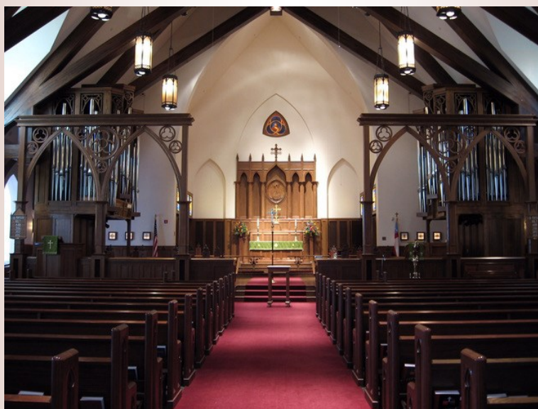
Holy Trinity Episcopal: Visser-Rowland, 1995 (III/65)