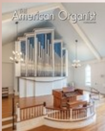
TAO November 2021