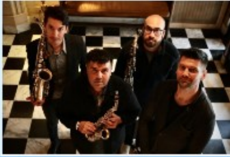
Sunday, January 9 Mana Saxophone Quartet

The award-winning Mana Saxophone Quartet presents "Made in America," an eclectic program of classical works and new commissions by American Composers.