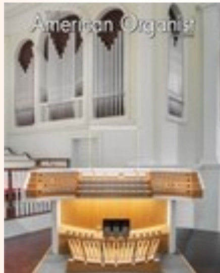
TAO, November 2022

Neutel will continue Reuter's business on a limited scope. All of the company's currently contracted projects will be completed either in the current building or at a smaller local shop. Neutel will also continue maintenance and tuning services, consulting services and work on selected projects.