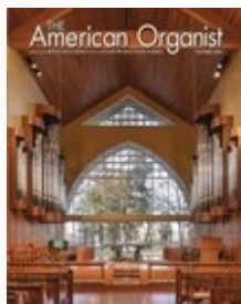
TAO, October 2023