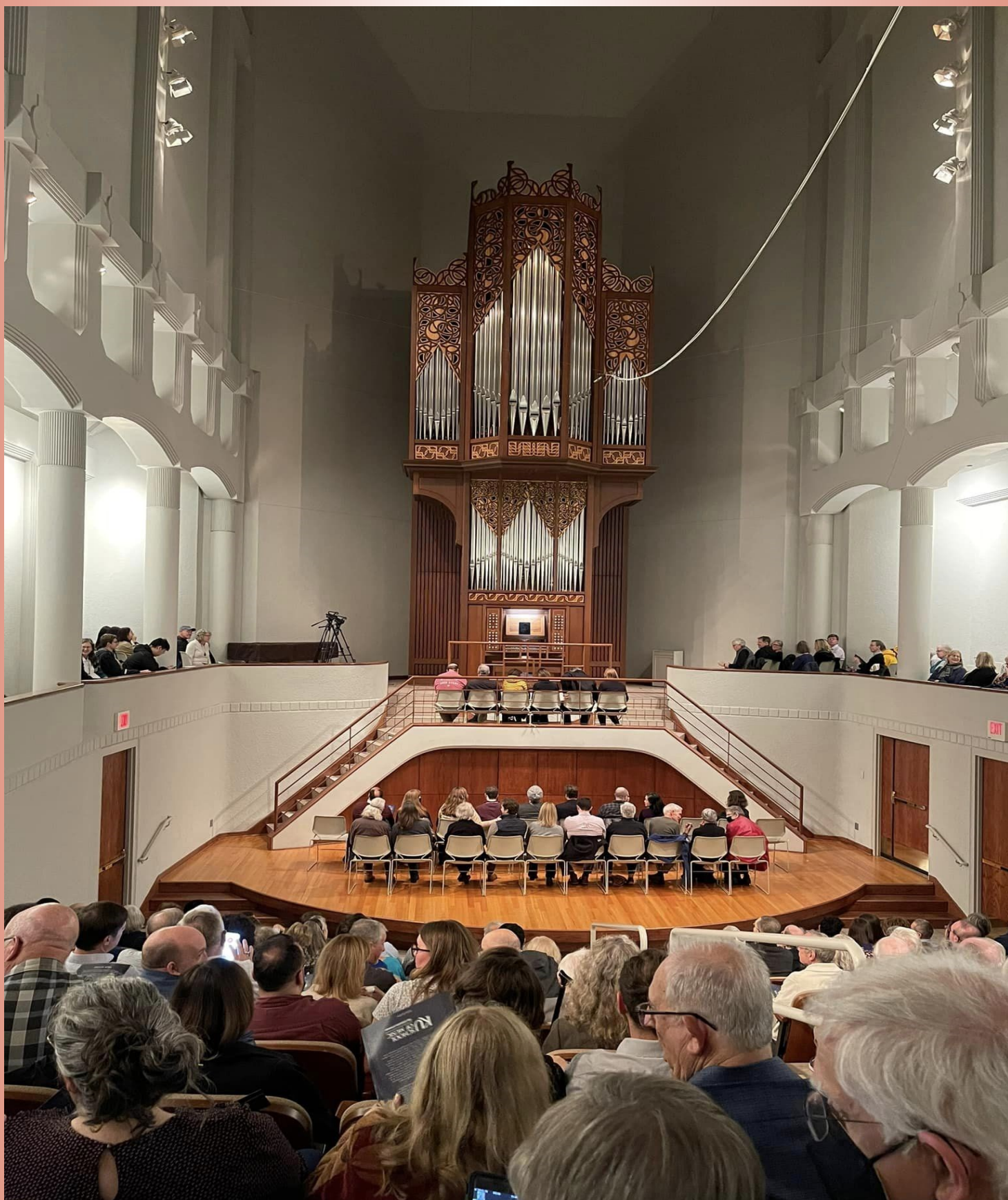
A full house for Olivier Latry's recital in Bales Organ Recital Hall at the University of Kansas. October 27, 2023