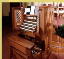
First Baptist Church 54 rank Moeller