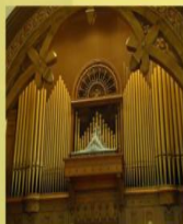
First Presbyterian Church 65 rank Aeolian/Skinner/Williams