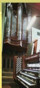
Trinity Episcopal Church 65 rank Letourneau