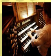
St. Luke United Methodist Church 44 rank Moeller

Specifications for these organs are available on our web site agocolumbusga.org